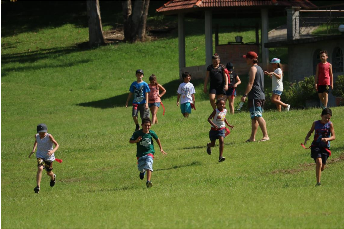
Meetings of volunteers and workshop participants